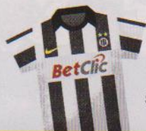
Jersey couture Soccer team uniforms go logo-happy p93